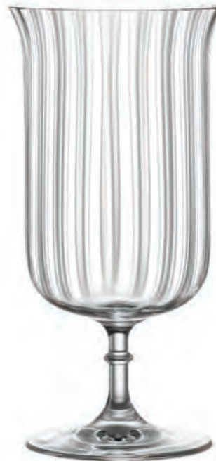
LS13DC12 ORIENT DECO Capacity 340 ml TD 77 mm FD 69 mm MD 77 mm H 160 mm CBM O.032