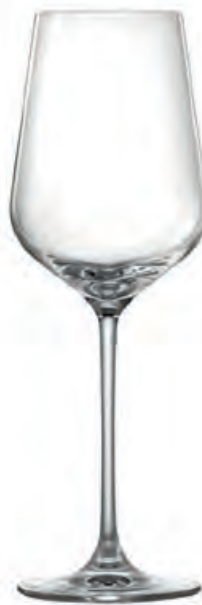
LSO4CB19 CABERNET Capacity 545 ml TD 67 mm FD 81 mm MD 90 mm H 263 mm CBM 0.067