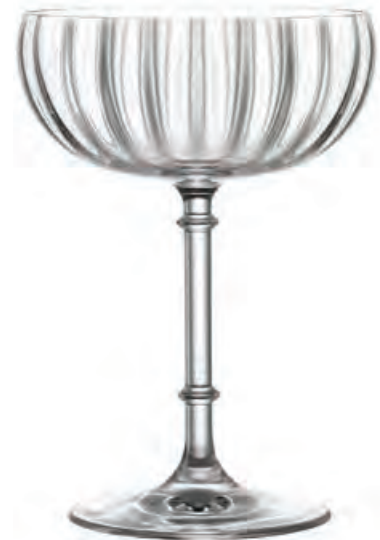
LS13SC07 ORIENT SAUCER Capacity 205 ml TD 90 mm FD 69 mm MD 95 mm H 133 mm CBM O.040