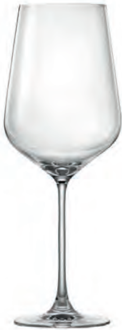
LSO4BD27 BORDEAUX Capacity 770 ml TD 75 mm FD 85 mm MD 102 mm H 275.5 mm CBM 0.089