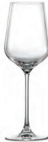
LSO4CD15 CHARDONNAY Capacity 425 ml TD 62 mm FD 81 mm MD 83 mm H 247.5 mm CBM 0.055