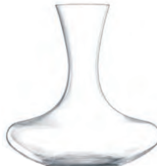
4GB01G0013 BLISS DECANTER (S) Capacity 750 ml TD 73 mm BD 100 mm MD 215 mm H 219 mm CBM 0.079