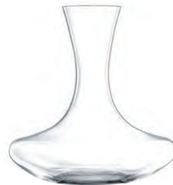
4GB01G0014 BLISS DECANTER (L) Capacity 1000 ml TD 80 mm BD 120 mm MD 234 mm H 241 mm CBM 0.098