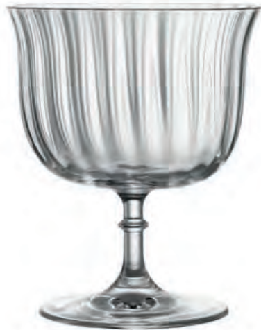
LS13LTO9 ORIENT LOTUS Capacity 270 ml TD 91 mm FD 69 mm MD 91 mm H 112 mm CBM O.031