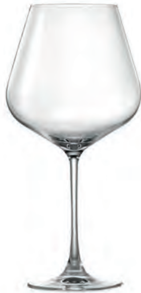
LSO4BG32 BURGUNDY Capacity 910 ml TD 76 mm FD 85 mm MD 122 mm H 252 mm CBM 0.114