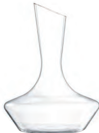
4GB01G0016 TEMPTATION DECANTER (L) Capacity 1000 ml TD 69 mm BD 127 mm MD 208 mm H 275 mm CBM 0.089