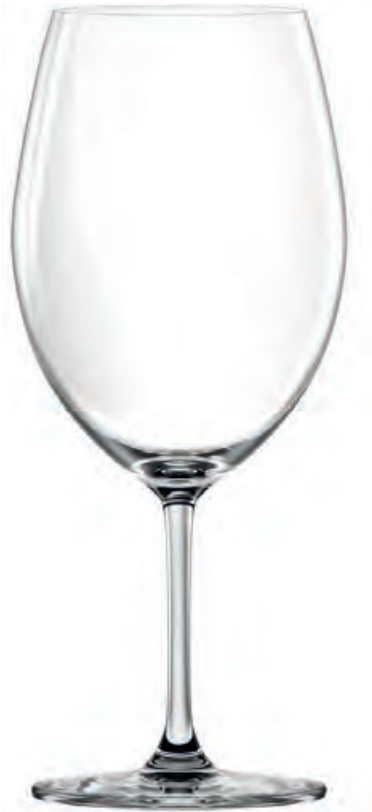
LSO1BD26 BORDEAUX Capacity 745 ml TD 78 mm FD 85 mm MD 100 mm H 226 mm CBM 0.071