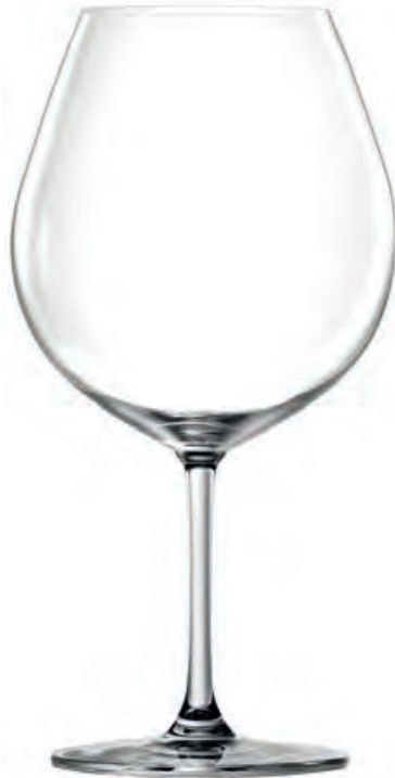
LSO1BG26 BURGUNDY Capacity 750 ml TD 72 mm FD 85 mm MD 110 mm H 212 mm CBM 0.081