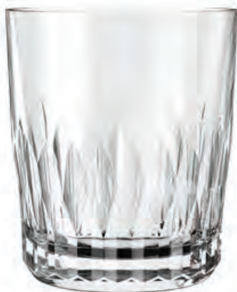
LP22DR12 RADIANT DOUBLE ROCK Capacity 350 ml TD 85 mm BD 73.5 mm MD 85 mm H 99 mm CBM 0.024