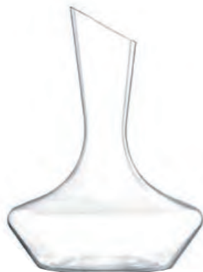
4GB01G0015 TEMPTATION DECANTER (S) Capacity 750 ml TD 63 mm BD 114 mm MD 188 mm H 249 mm CBM 0.069