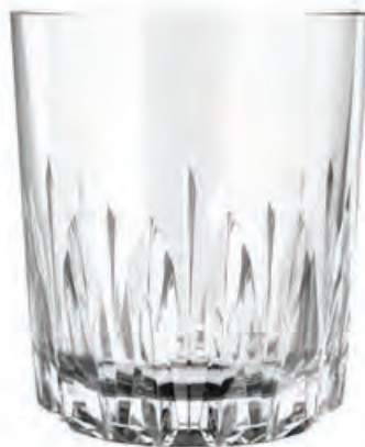
LP23DR12 DAZZLE DOUBLE ROCK Capacity 350 ml TD 85 mm BD 73.5 mm MD 85 mm H 99 mm CBM 0.024